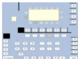
Table Management which handles complete table and seat order assignment

Work Station which is the dynamic order touch screen interface